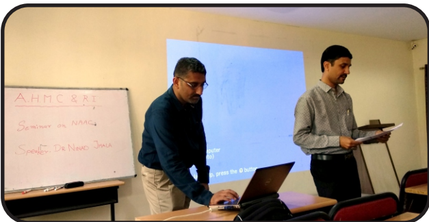
Seminar on NAAC