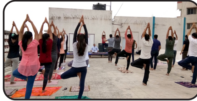
World Yoga day celebration