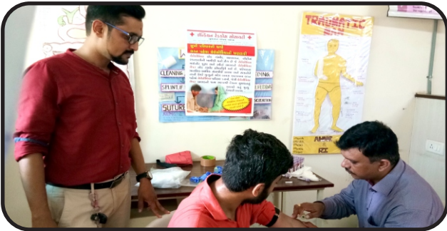
Thalessemia Awareness Camp