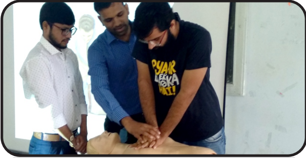
Workshop on basic life support