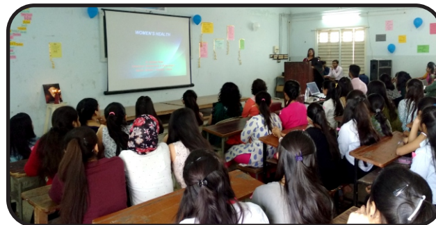
Woman's day celebration