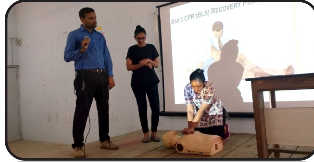
Workshop on basic life support