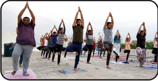
World Yoga Day celebration