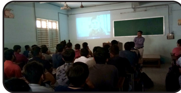
Thalessemia Awareness Camp